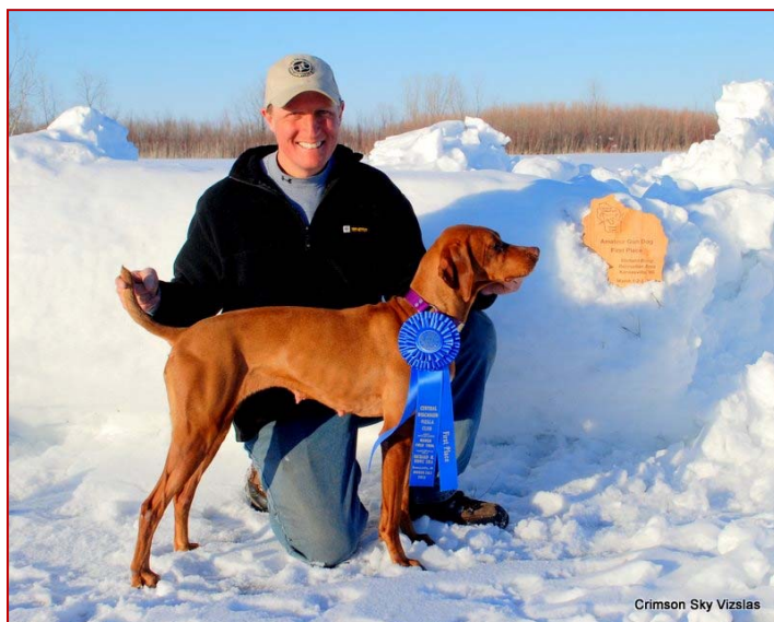
Crimson Sky Vizslas