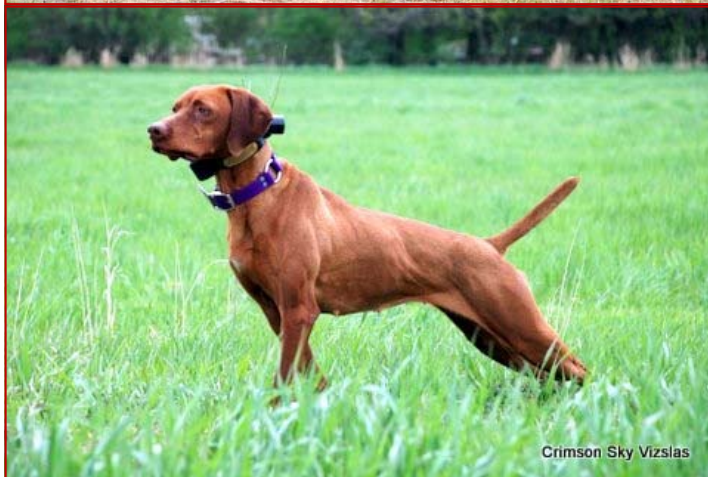
Crimson Sky Vizslas

Izzy has exceeded our expectations in every way. She has always had a high work ethic. Izzy has a great nose, fantastic style, and wants to please. As a young dog she ran a few trials in Puppy and Derby but I was more interested in a new hunting dog than another trial dog. I decided to make her my hunting companion or “meat dog”. Our Holly was getting older and I needed another dog just to hunt with, but Izzy had other plans. I entered her in the Midwest Vizsla Futurity as a fill dog. She was a young dog at 15 months and didn't have that wild, independent and loose style, but looked great on her birds. She didn't place or really even get a serious look from the judges, but handled 5 birds broke and backed her brace mate. I decided then and there I would run her in a few trials. She has become the most honest dog I own. At just over 3 Years old Izzy has placed in 2 National Field Trials and earned her AFC easily. Currently she is a couple points short of her Field Championship. Hopefully we can earn her FC this fall. Izzy is the mother of our newest male Gauge. We expect great things from her and her puppies.