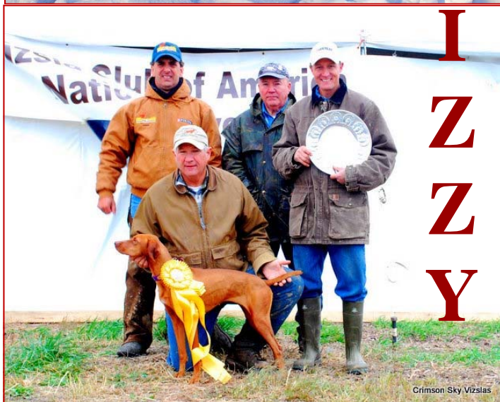
Crimson Sky Vizslas