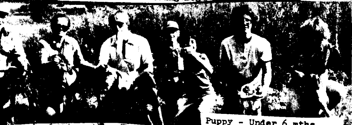
Puppy - Under 6 mths.