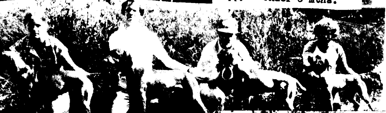
Field Trial Hunting