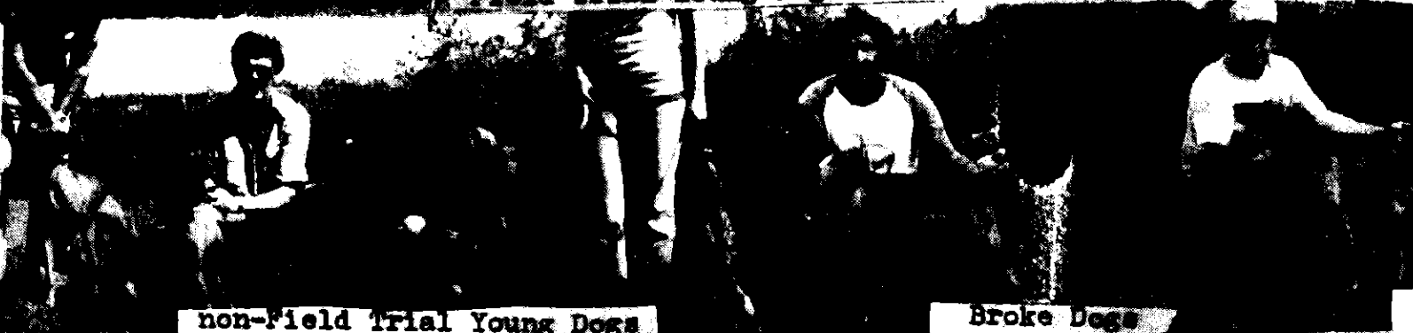
non-Field Trial Young Dogs