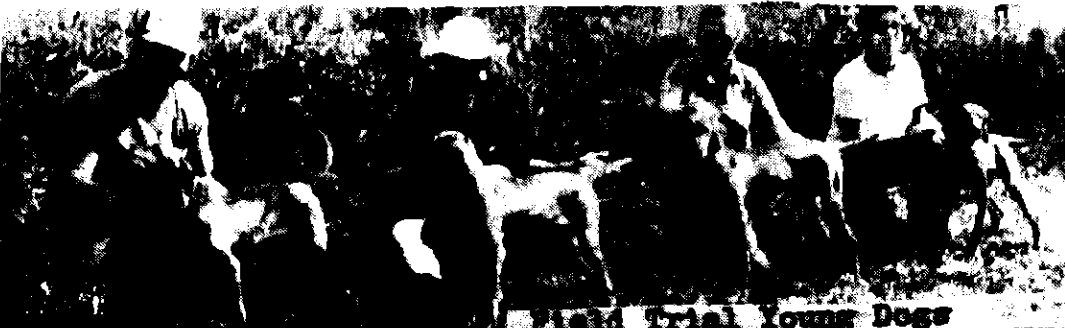
Field Trial Young Dogs