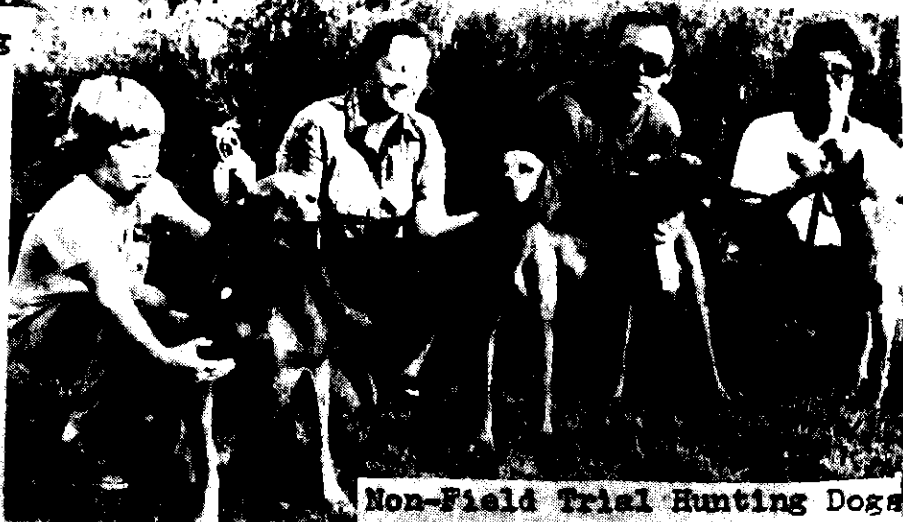
Non-Field Trial Hunting Dogs