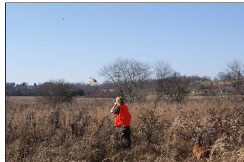
Zach Simpson pheasant hunting