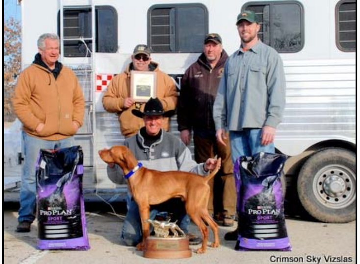
Crimson Sky Vizslas