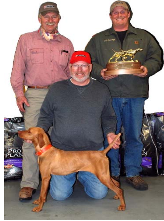
Does your breeding have what it takes? Nomination forms and rules available at www.vizslafuturity.com

American Field Registered Event Midwest Vizsla Futurity 2011 Winner Burr Oak's Red Neck Cowgirl "Casey"