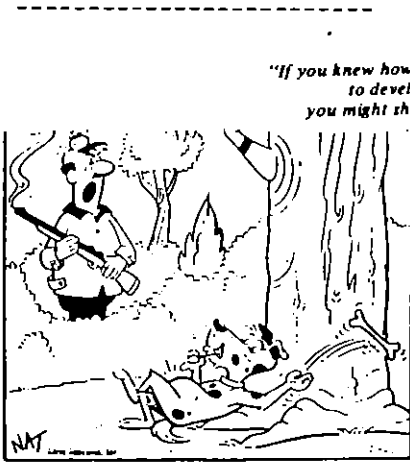
"You're some retriever!"

These points are just the basics. There are free brochures on the care, training, and feeding of dogs put out by Ken-L Ration.