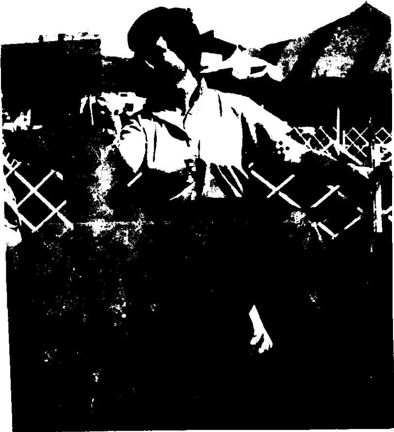
CH. POLAR KAPS SPORTING GOODS (Sire: Ch. Timarka's Thorny, Dam: Ch. Timarka's Tabu)

Two years in a row "Baron" has taken Best of Breed at the VCOI Specialty. Along with this honor, he has, so far this year, won 15 Best of Breeds, defeating 85 dogs.