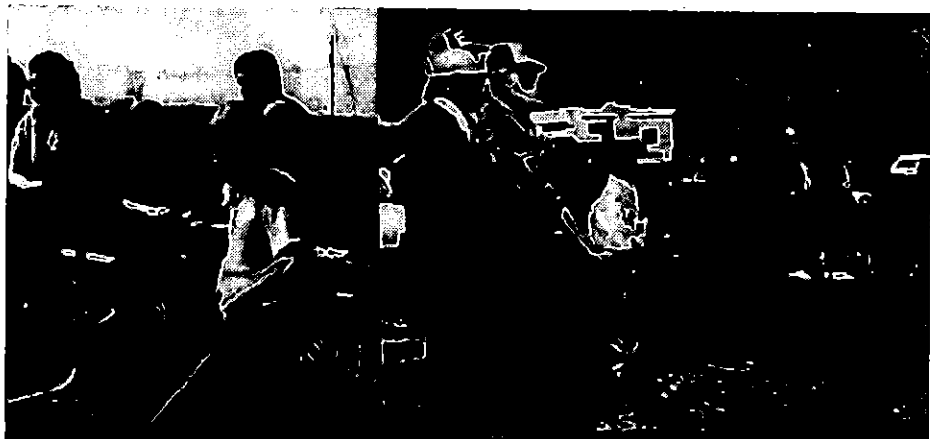
SPECTATORS CHECK OUT THE ACTION