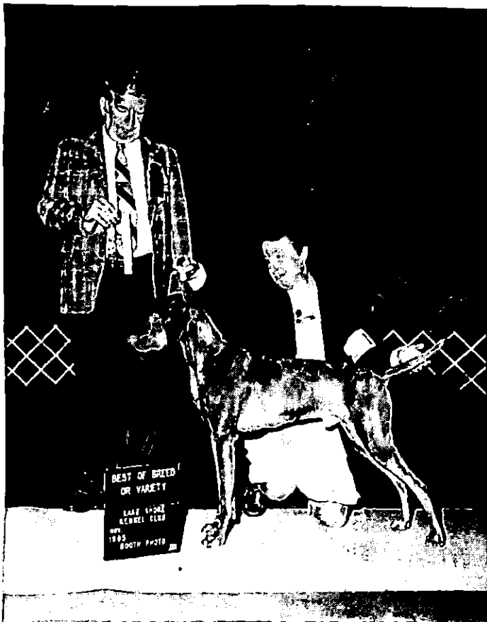
CH POLAR KAPS KI VON KALYPSO